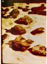
PLATE IX. Radiometric color picture of lichen-bearing rocks and bark taken by JPL Viking test lander camera and processed as Mars pictures. Comparison with Plate VIII demonstrates difficulty in distinguishing color, contrast and shape of lichen colonies after Viking processing.