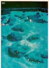
PLATE XII. Saturation analysis in 0-30 DN range (0-12 % saturation) of lichen-bearing materials shown in Plate VIII.

Plate I(a) is a portion of the first color picture taken on Mars by Viking 1. Some portion of the rocks and ground surface are perceived as green relative to the surrounding area. While this color is perceived as green, and is so called in this paper, the actual colors on Mars remain somewhat indeterminate. Thus, the Mars landscape was reported (NASA P-17164, July 1976) to be mostly "orange-red". More recently (Huck et al. , 1977), a six channel spectrophotometric analysis of the Viking lander camera data found the surface of the planet predominantly "moderate yellowish brown" with variations including "moderate olive brown".