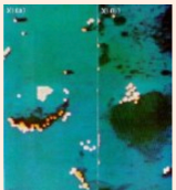
PLATE XI. (a) Saturation analysis in 0-60 DN range (0-24 % saturation) of sol 1 picture of Patch Rock. Viking Picture 12A006/001. (b) Saturation analysis in 0-60 DN range (0-24 % saturation) of sol 302 picture of Patch Rock showing change corresponding to shift in position of patch (compare to Plate I). Viking Picture 12D125/302.